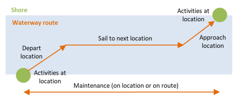
Fig. 4 The five phases of waterborne transport (Wennersberg and Nordahl 2019)

The owner targets at removing the crew from the ship and thus transforming the operations from crewed to unmanned. This target applies to the operational phases depart location, sail to next location, approach location and a subset of the activities in the phase activities at location. The barge will, in the beginning, depend on the onshore