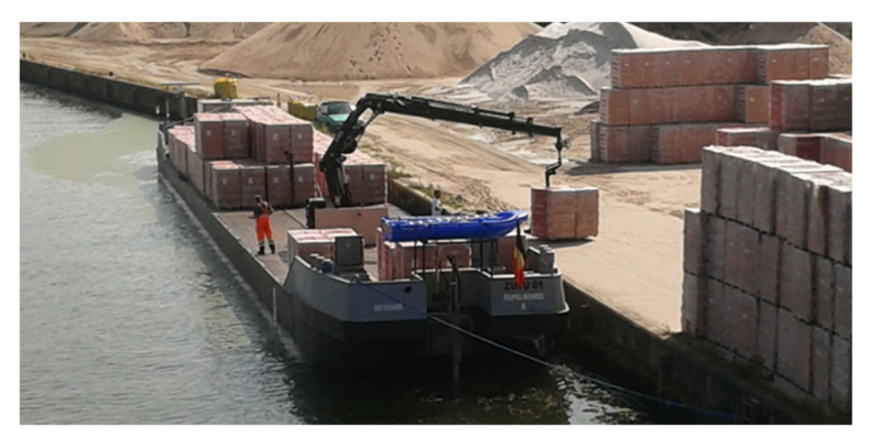
Fig. 2 IWW - Pallet shuttle barge

The PSB operates between smaller ports and quays along rivers and canals in the Flemish Region. Larger ports and harbours, such as its home port Antwerp, are avoided due to the