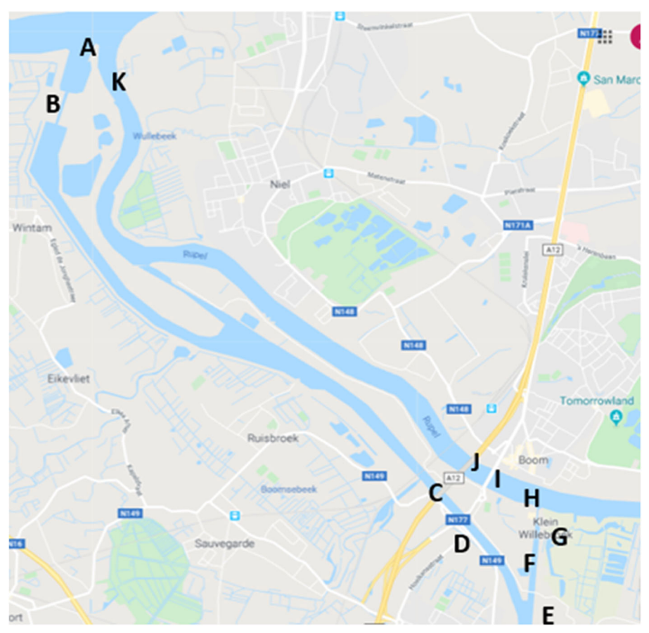
Fig. 3 AUTOSHIP test area. Adapted from (Google maps 2020)